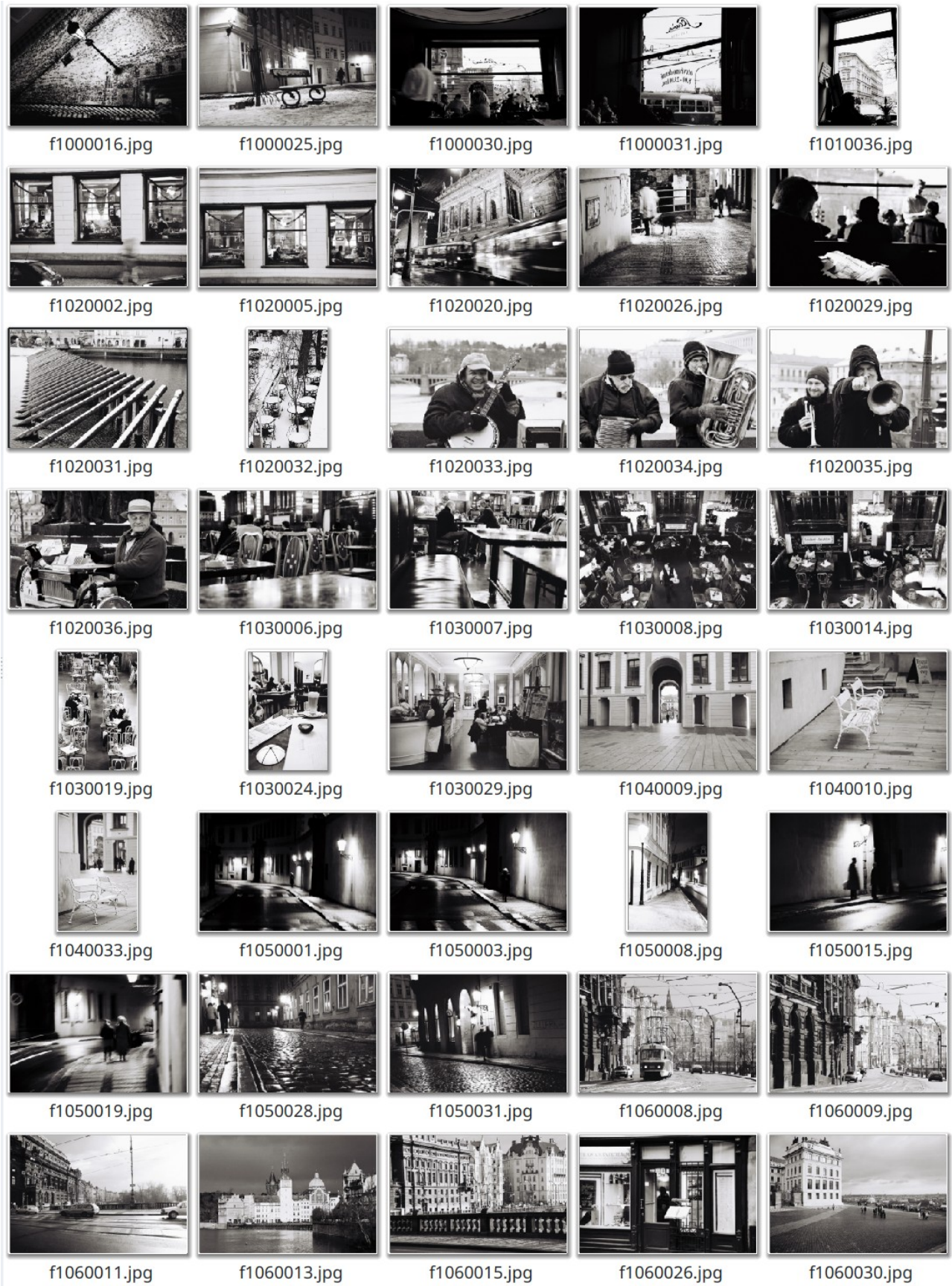
Figure 1. Samples from photographs taken between 1997 and 2005.