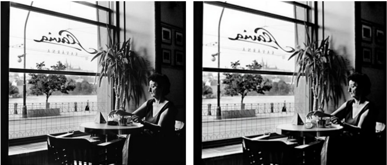
Figure 2. Left: Section of an original photograph, woman reaches for an ashtray on the table. Right: Modified version where the woman reaches for a coin instead. Note: This is a quick and dirty ad hoc demonstration of the replacement method using a low-resolution version of the photograph. The final version is museum-quality in terms of resolution, color depth, sharpness, and so on, and it is clear that the coin is a Bitcoin.

In each photograph of Timeshifting Prague , subtle changes have been made that are only recognisable if you look out for them. 99% of the original remains authentic. Examples of modifications include added Bitcoin coins on a café table, a Bitcoin VIP's face in a crowd, the Bitcoin formula as graffiti on a wall, or a modified newspaper headline. Figure 2 shows an example.