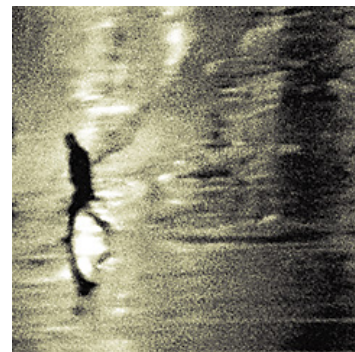
Dark Days – New York, Art Gallery „Slow Art“, SIGGRAPH 2008, Los Angeles

"Pointing to an estranged reality and isolation fostered in a fast-paced contemporary urban environment, these photographs illustrate lone figures in a tonal and textural space that could only be accomplished by combining the analogue with the digital."